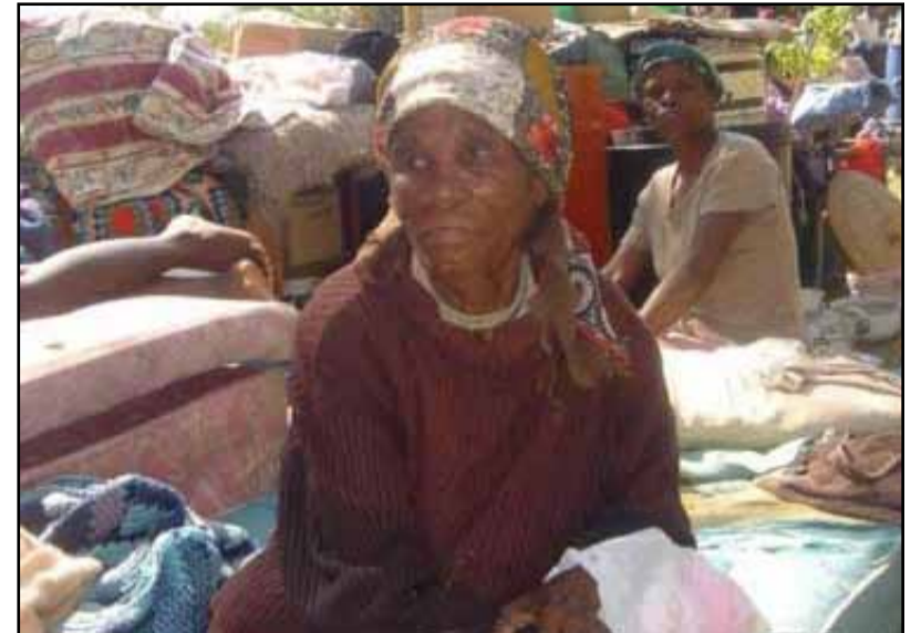
An elderly woman ponders her next move after her house was destroyed during Operation Murambatsvina

Never again in the history of this nation should the people of Zimbabwe allow political leaders to play atrocious games with them. First it was Gukurahundi , then Murambatsvina , then came Operation Mavhotera Papi , now we are told of an Operation Chimumumu ahead of the Constitution-outreach programme.