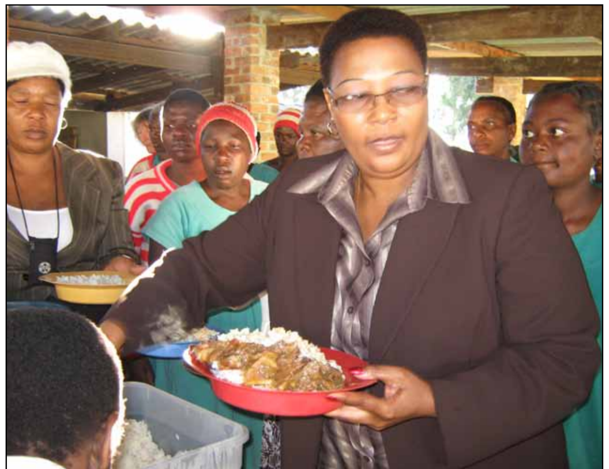
VP Khupe dishes out Christmas lunch to inmates at Chikurubi Prison

The MDC as a people's project, values your opinions. Please feel free to send news, alerts or letters expressing your views and comments to MDC Information and Publicity Department or email: mdcnewsbrief@gmail.com