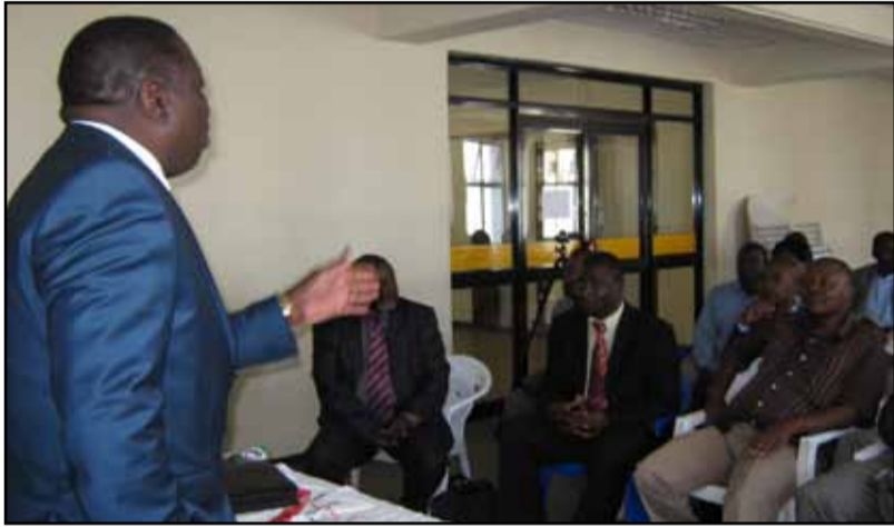
President Tsvangirai addresses Harare Councillors

HARARE-Discipline in office and thriving to bring efficient and corruption-free service to the people of Harare should be the major mandate of MDC councillors, President Morgan Tsvangirai told Harare councillors.