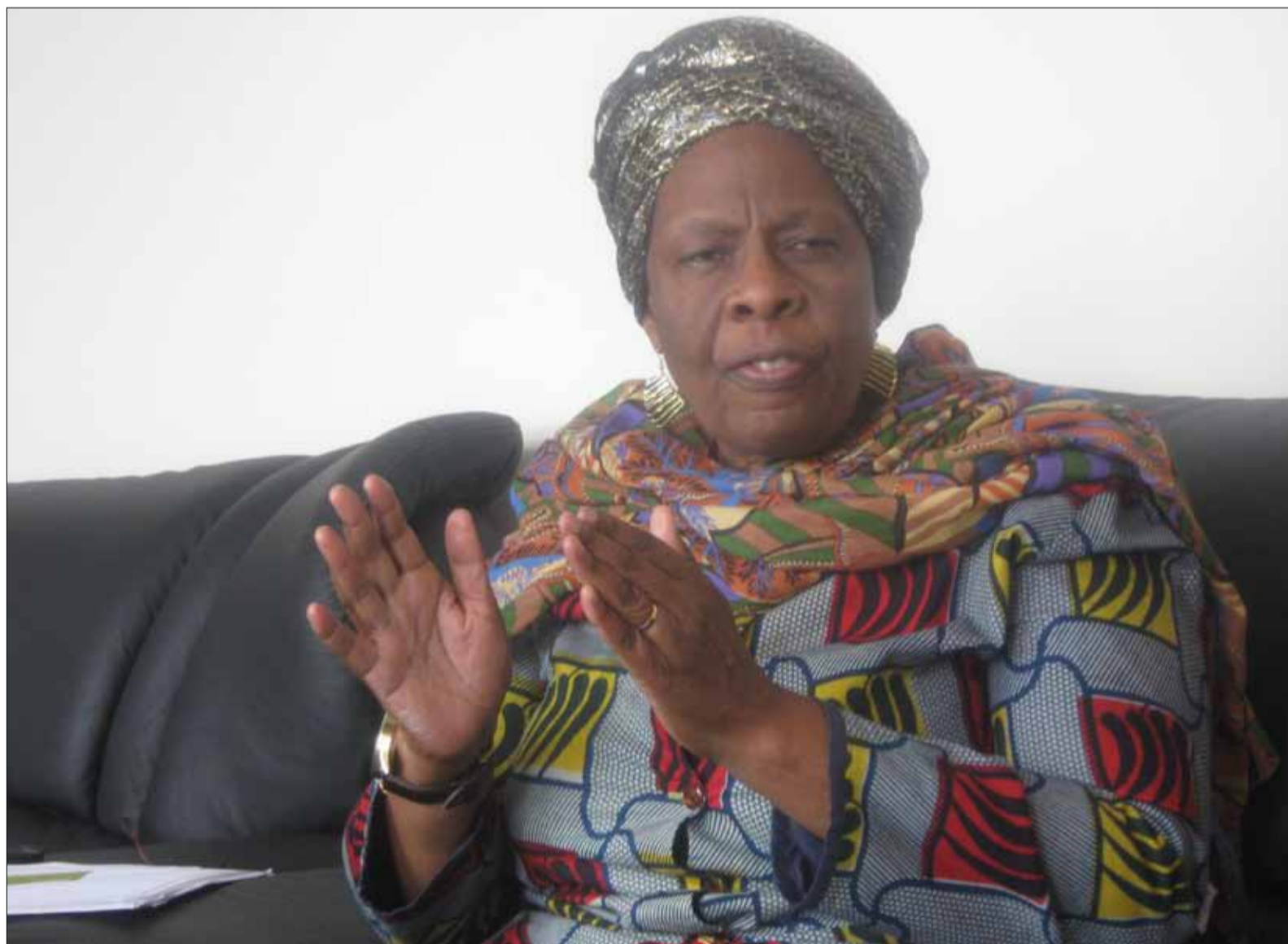
Minister of State in The Prime Minister's Office, Hon Sekai Holland

Over 20 000 people were killed in the Matebeleland and part of the Midlands regions by State security agents between 1980 and 1987.