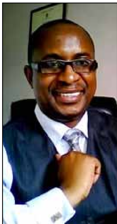
Senator Obert Gutu

The recently held ZANU PF congress was indeed, an exercise in futility.