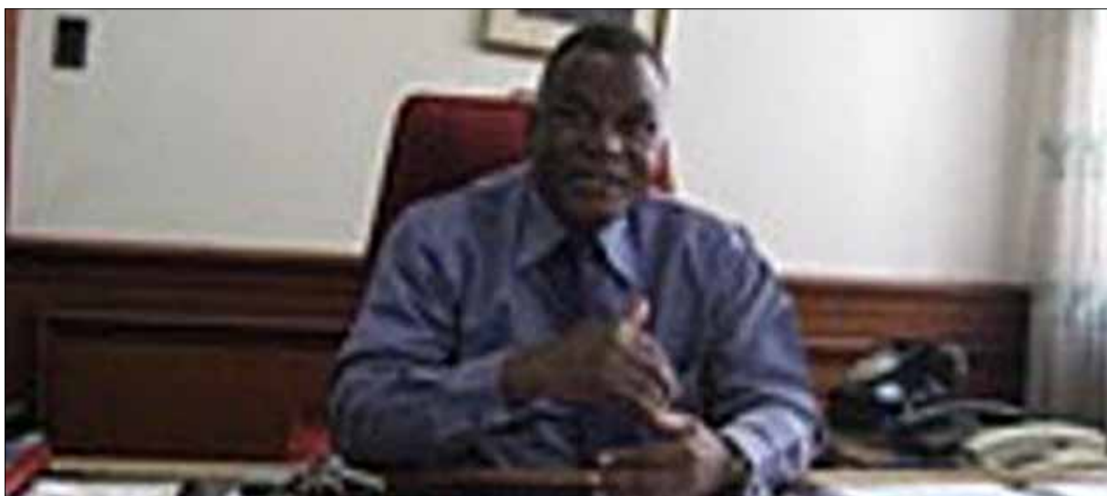
Bulawayo Mayor Thaba Moyo

Commenting on the issue of dilapidated and idle buildings, Mayor Moyo said council was aware of unoccupied buildings but at the moment council does not have a policy in place to take over the premises. He however said