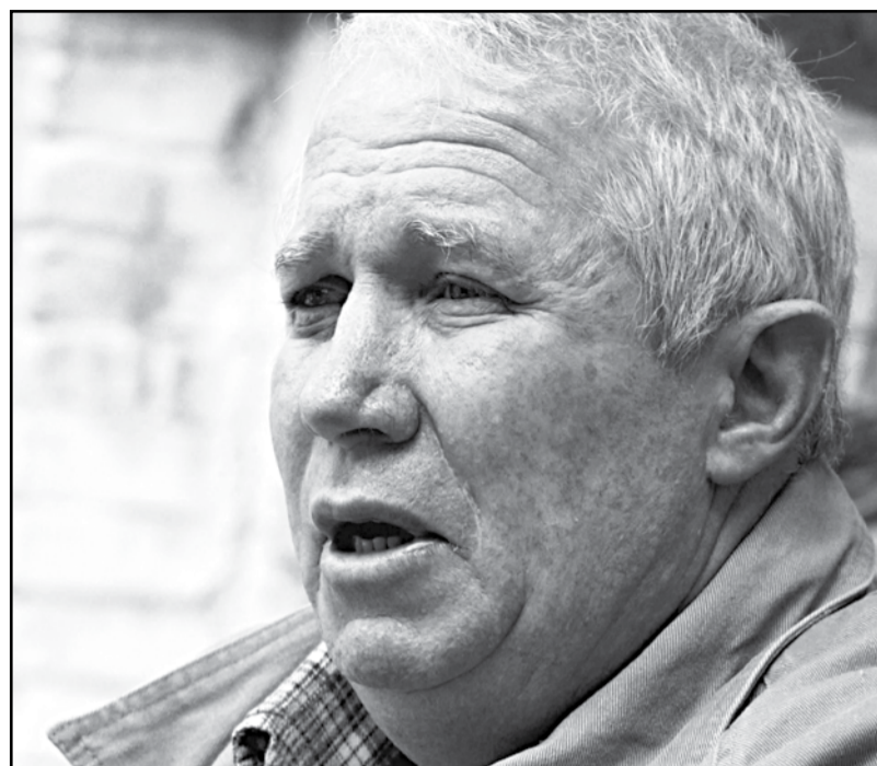
Hon. Roy Bennett